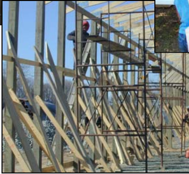
Creating New Businesses